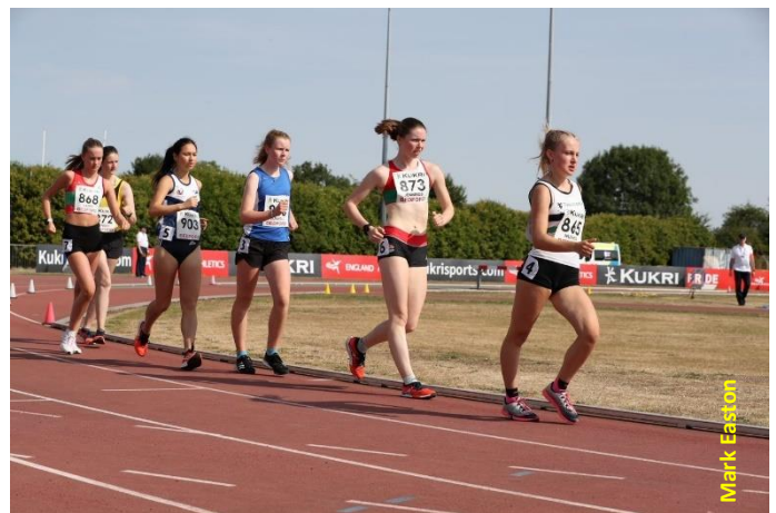
Early stages of the women's U23/U20 race