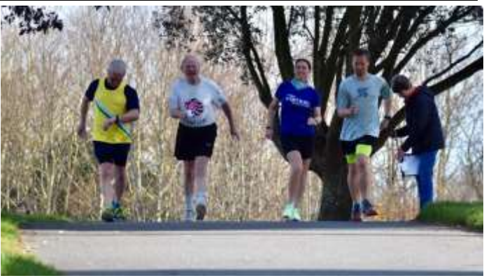
24th Apr.: Sarnia WC Championship #3 3km Road Walk, Cambridge Park (B)