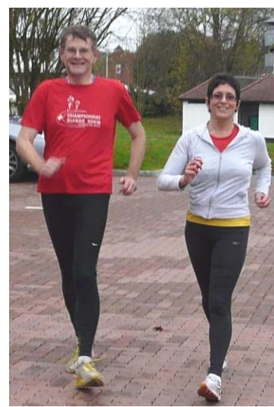
The champions seen here warming up prior to the Surrey WC 7 miles on 13th November

The team title was closely contested until the Hillingdon race, where Ilford missed out on the bonus points and Surrey WC fell away in the second half of the year enabling the EHAC B team to clinch third spot.