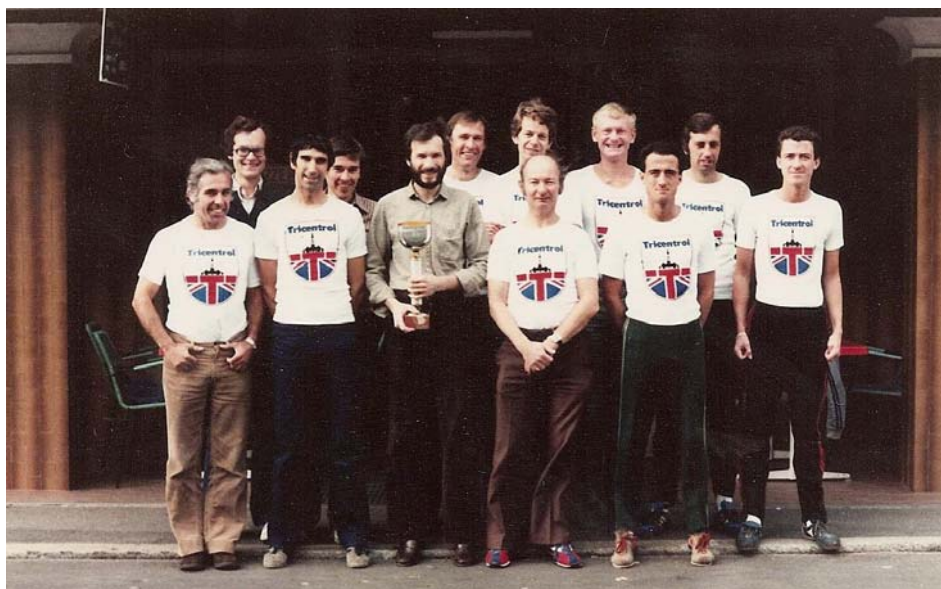
Stock Exchange Athletic Club 1980's outside our hotel at Rivera